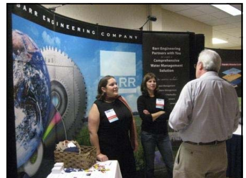
MnAFPM & WAFSCM Combined Annual Conference—November 7th, 8th and 9th, 2009