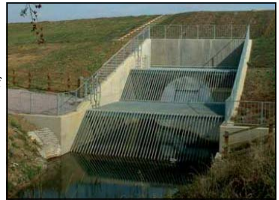
An exterior view of a vortex valve in Weedon Bec, UK. The unit installed at Weedon Dam has the facility to adjust the controlled outflow between just over 2,000 to 3,000 gallons per second via the use of removable stop logs on its intake.

Vortex valves act like natural hydraulic brakes. Designed with a snail or conical shape, high flows initiate a vortex within the valve which in turn restricts the flow of water out of the device. When head pressure builds, water circulates in a